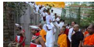
ABOVE: The Great Stupa of Universal Compassion nearing completion. Images from the film documentary of the gifting of the Maha Bodhi sapling officially witnessed by the First Secretary from the Australian High Commission in Sri Lanka and more than 100 well wishers

Following a formal ceremony in Anuradhapura, the sapling was flown to Australia where it will be planted in the Sri Lankan Shrine at the Great Stupa in Bendigo. Growing into a mature tree, it symbolises solidarity and mutual respect among Buddhist communities.